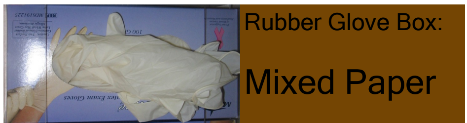
Rubber Glove Box: Mixed Paper

If backing of medical supply packaging can be ripped, it can go to mixed paper. If not, put in garbage