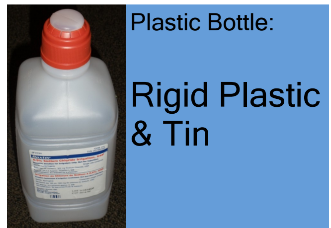
Plastic Bottle: Rigid Plastic & Tin

Any piece of rigid/hard plastic is accepted in the rigid plastic stream. No minimum size restrictions or number required.