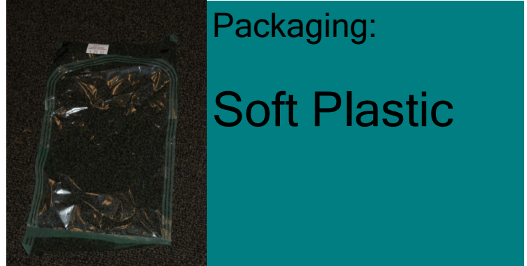
Packaging: Soft Plastic