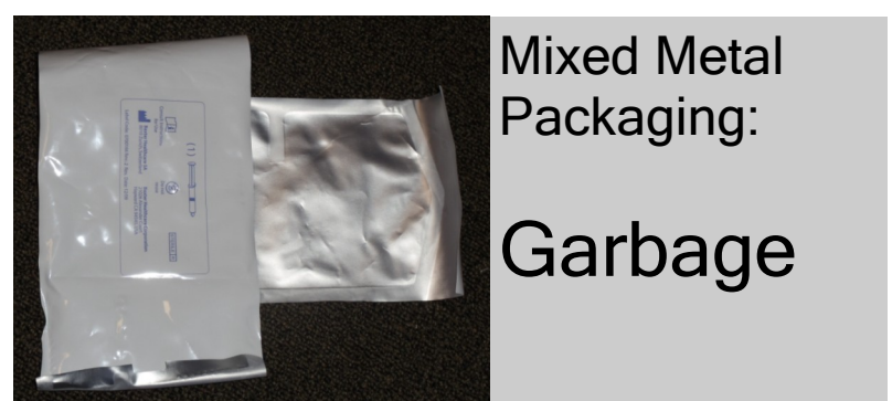
Mixed Metal Packaging: Garbage