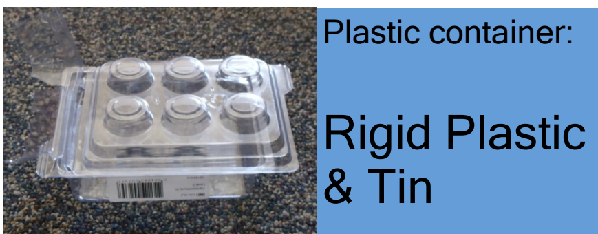
Plastic container: Rigid Plastic & Tin