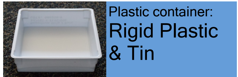
Plastic container: Rigid Plastic & Tin

If backing of medical supply packaging can be ripped, it can go to mixed paper. If not, put in garbage