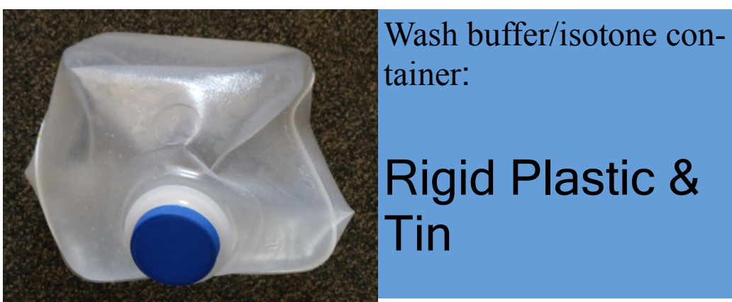
Wash buffer/isotone con- tainer: Rigid Plastic & Tin