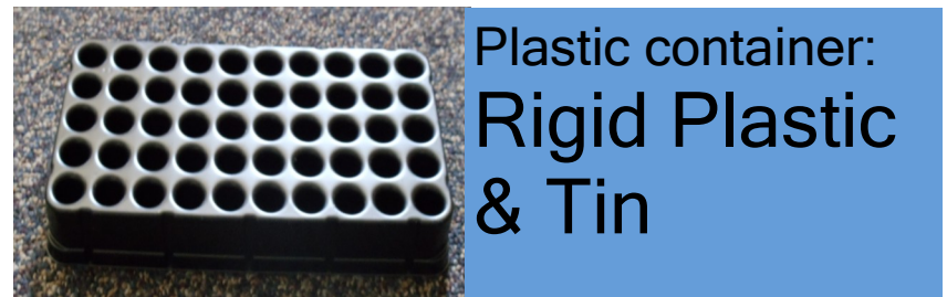
Plastic container: Rigid Plastic & Tin