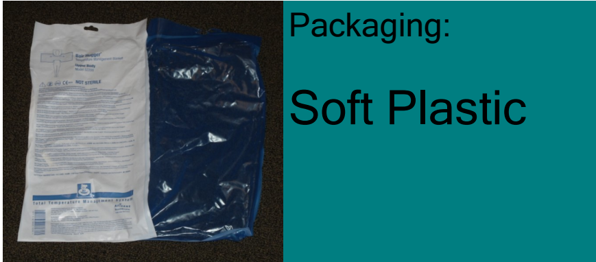
Packaging: Soft Plastic