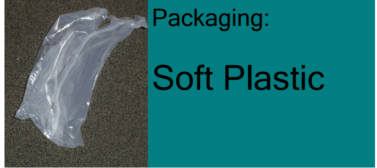
Packaging: Soft Plastic