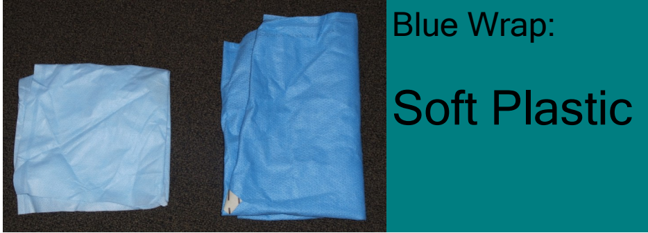
Blue Wrap: Soft Plastic