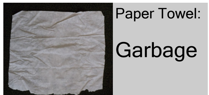
Paper Towel: Garbage

Any piece of rigid/hard plastic is accepted in the rigid plastic stream. No minimum size restrictions or number required.