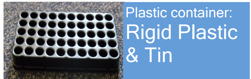
Plastic container: Rigid Plastic & Tin