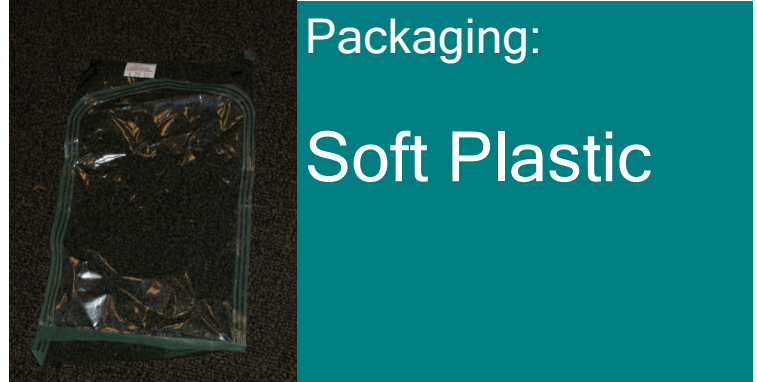
Packaging: Soft Plastic