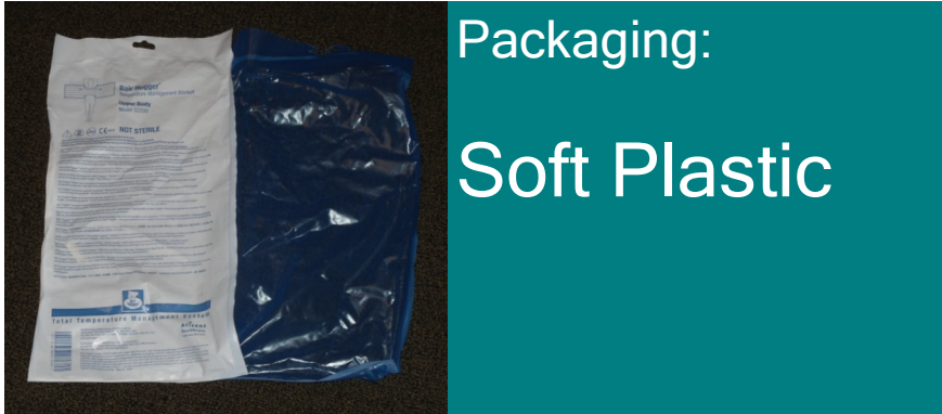
Packaging: Soft Plastic