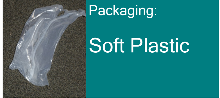
Packaging: Soft Plastic