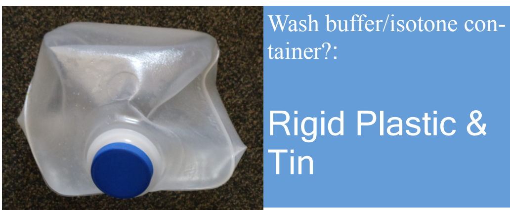
Wash buffer/isotone con- tainer?: Rigid Plastic & Tin