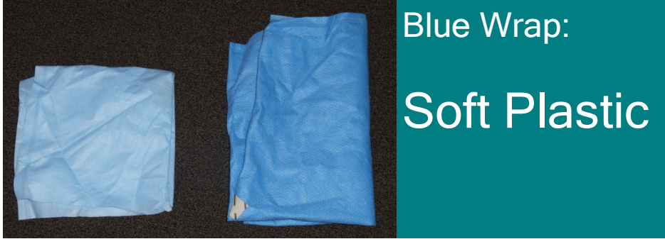
Blue Wrap: Soft Plastic