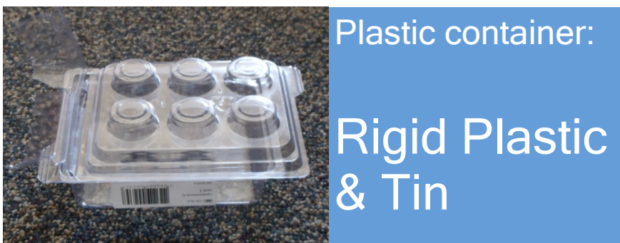
Plastic container: Rigid Plastic & Tin

If backing of medical supply packaging can be ripped, it can go to mixed paper. If not, put in garbage