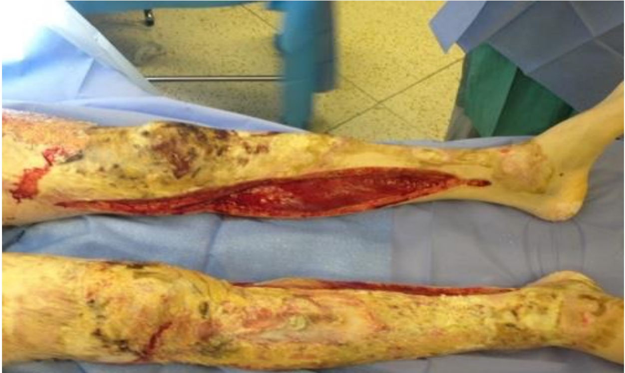
Incision of lower limb