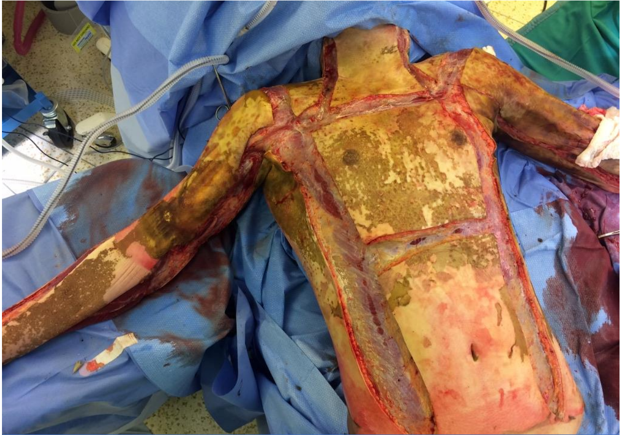
Escharotomy of chest, abdomen, and upper limbs

Papp, A. (2025). Escharotomy of chest, abdomen, and upper limbs .