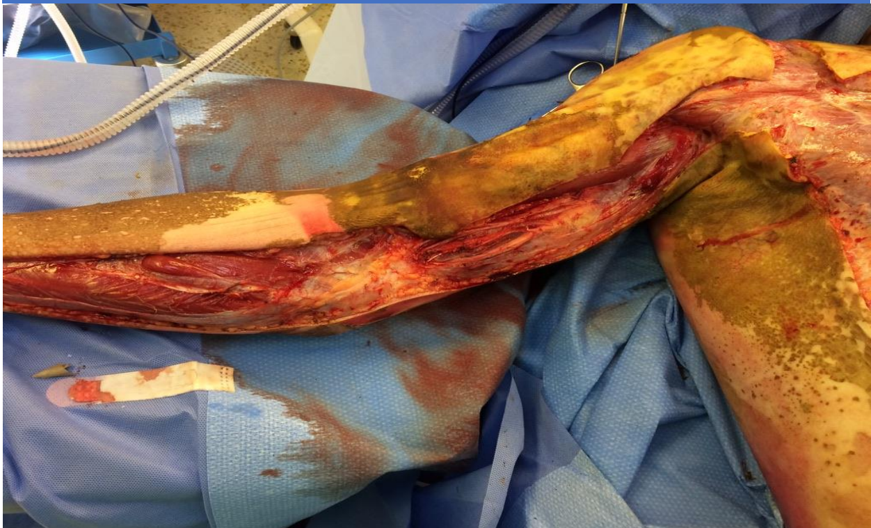
Incision of upper limb

Papp, A. (2025). Upper and Lower Limb Escharotomy .